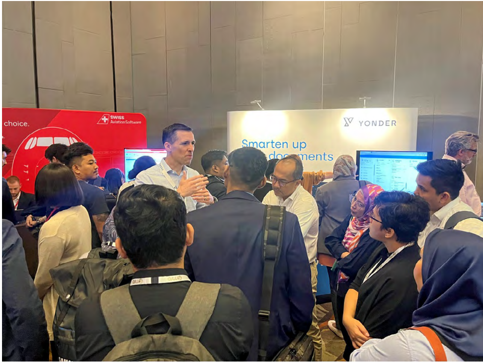
Images from 2023 Conference