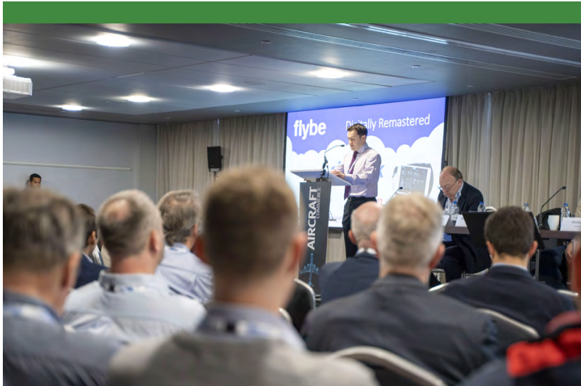
Keynote Presentations/Case Studies